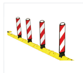
Quick Marker with Tornado 75-Flex