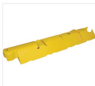
Traffic Guidance System Quick Marker