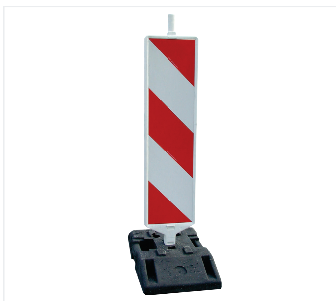
Standard Beacon in base plate K1